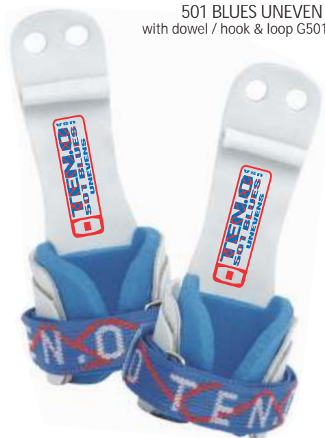
501 BLUES UNEVEN BAR GRIP with dowel / hook & loop G501-10 $39.95 sizes: 0-3