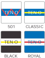
TEN.O 3" Small Wristbands 2.5"x 3" 93% cotton,4% nylon, 3% spandex WB511 $4.75 four colors