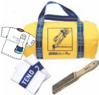
CLASSIC GRIP KIT wristband, grip brush & a Classic tee magnet GK612-C $19.95