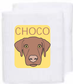
CHOCO WRISTBANDS WB524 $5.50

This pair of 3"x5" Choco Embroidered Wristbands are one of our favorite new products. Gymnastics wristbands like no other! The extra padding in these tightly woven and more sophisticated knitting process allows for a design that meets ALL of a gymnast's requirements that provide comfort, fit, protection, and warmth for those long workouts.