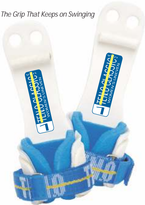
The Grip That Keeps on Swinging

Durable heavy duty white split grain leather for the strong swinging gymnast.