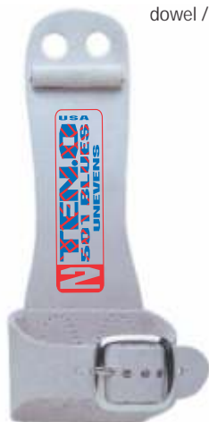
501 BLUES UNEVEN BAR GRIP dowel / buckle G501-12 $38.95 sizes: 0-3

501 Blues Uneven Bar Buckle Dowel Gymnastics Grip. Just imagine grips that fit with the comfort of your oldest, most faded jeans-from the first swing.